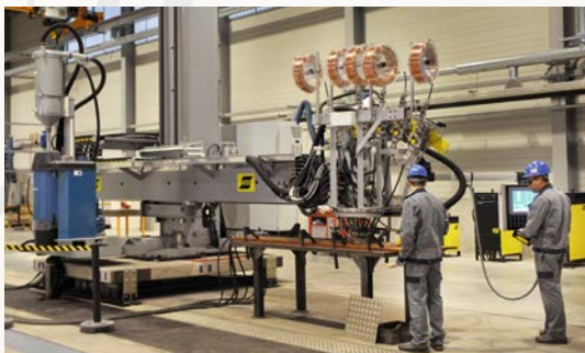
Welding laboratory: Multi-wire Submerged Arc Welding (SAW)

ArcelorMittal's full engineering approach begins with characterisation of materials and continues through to component testing.